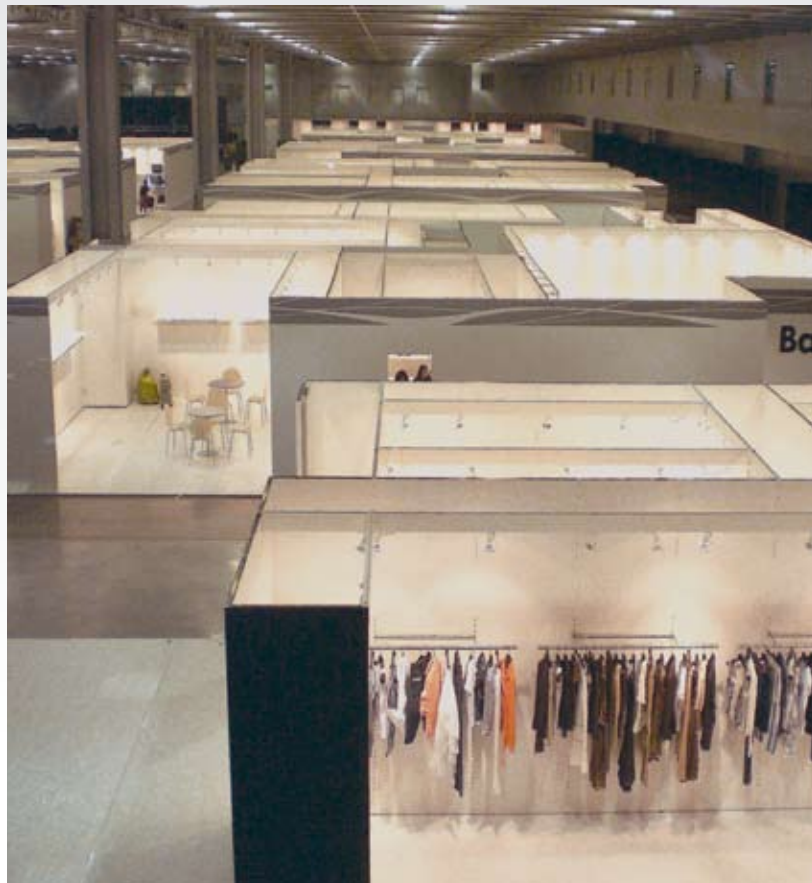
Crocus Expo Russia

4.000 wall elements were installed by ~ 30 assembly fitters in one day. On more than 2.000 running metres light beam (cf. Light Fitting Programme D1088) were mounted lighting tracks and light fittings.