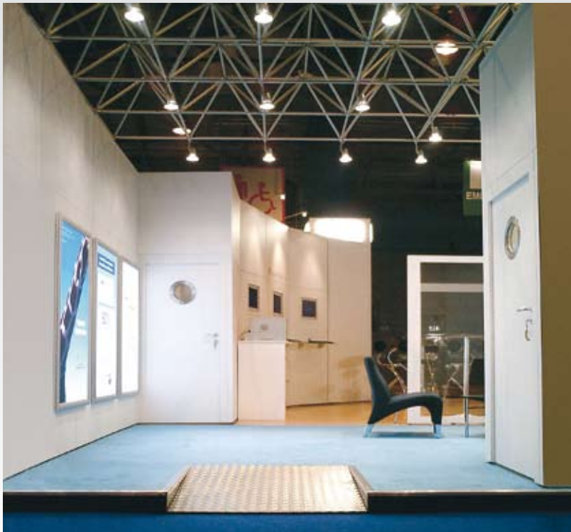
Exhibition Services, UK

Enlarge the scope of design. The creative profile is the interface to the R8 System or similar aluminium systems and for special solutions.